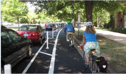
Traffic Calming Measure: Bike Lanes