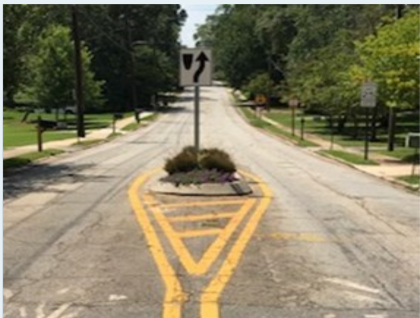
Traffic Calming Measure: Center Island