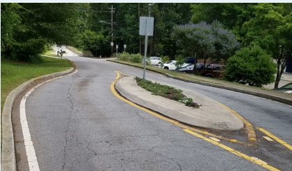
Traffic Calming Measure: Splitter Island