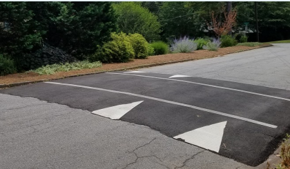
Traffic Calming Measure: Speed Table